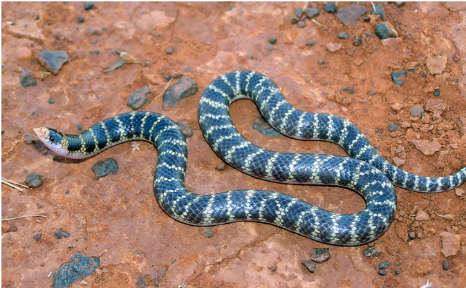
Norwest Shovel-nosed snake ( Brachyuropsis approximans )