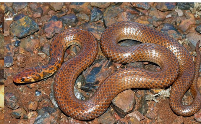
Little Spotted Snake ( Suta punctata )