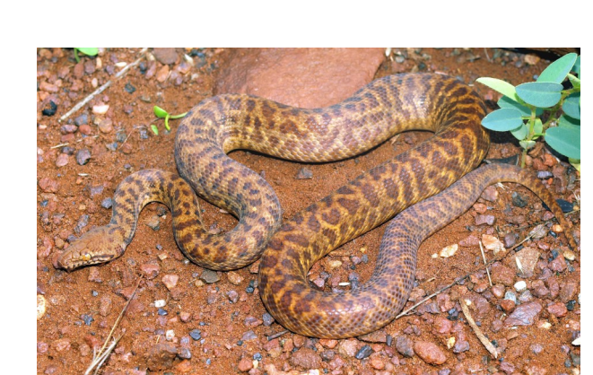
Pygmy Python ( Antaresia perthensis )