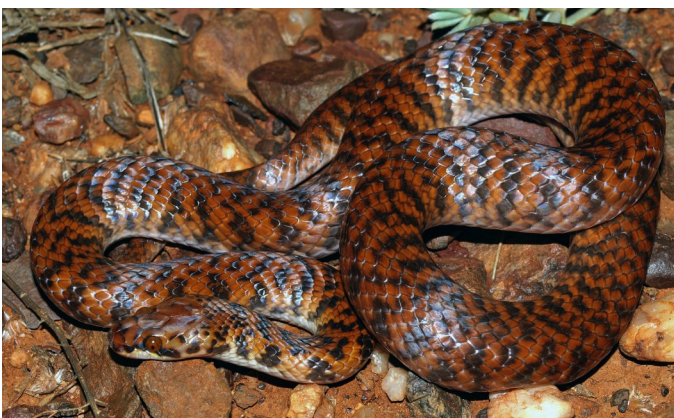
Rosens Snake ( Suta fasciata )