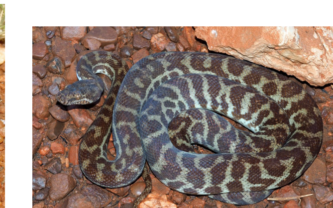
Children's Python ( Antaresia childreni )