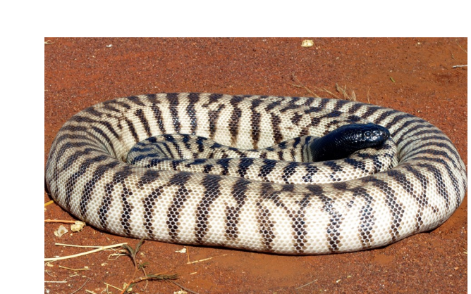
Black-headed Python ( Aspidites melanocephalus )