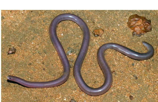
Pilbara Blind Snake ( Anilius ammodytes )