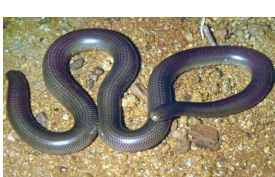
Pilbara Flat-headed Blind Snake ( Anilius ganei )