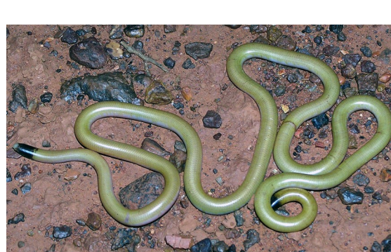
Black-tipped Blind Snake ( Anilius grypus )