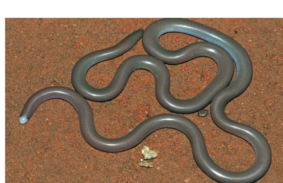
Common Beaked Blind Snake ( Anilius waitii )