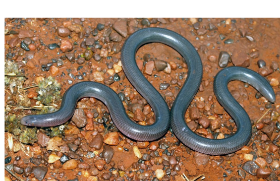
Pale-snouted Blind Snake ( Anilius hamatus )