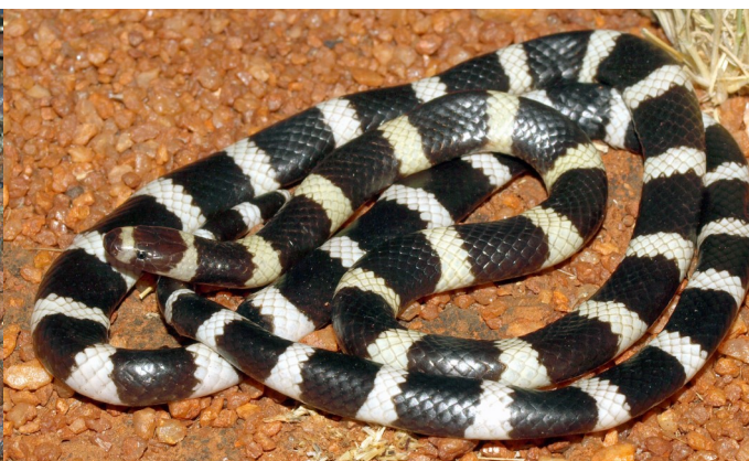
Pilbara Bandy Bandy Snake ( Vermicella snelli )