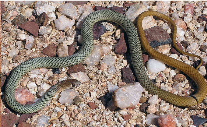
Coppertail Whip Snake ( Demansia reticulata )