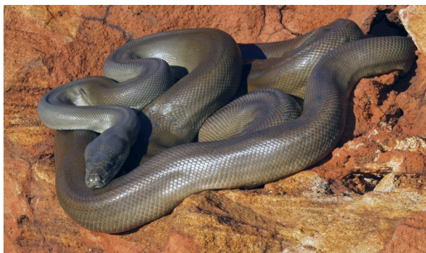
Pilbara Olive Python ( Liasis olivaceus barroni )