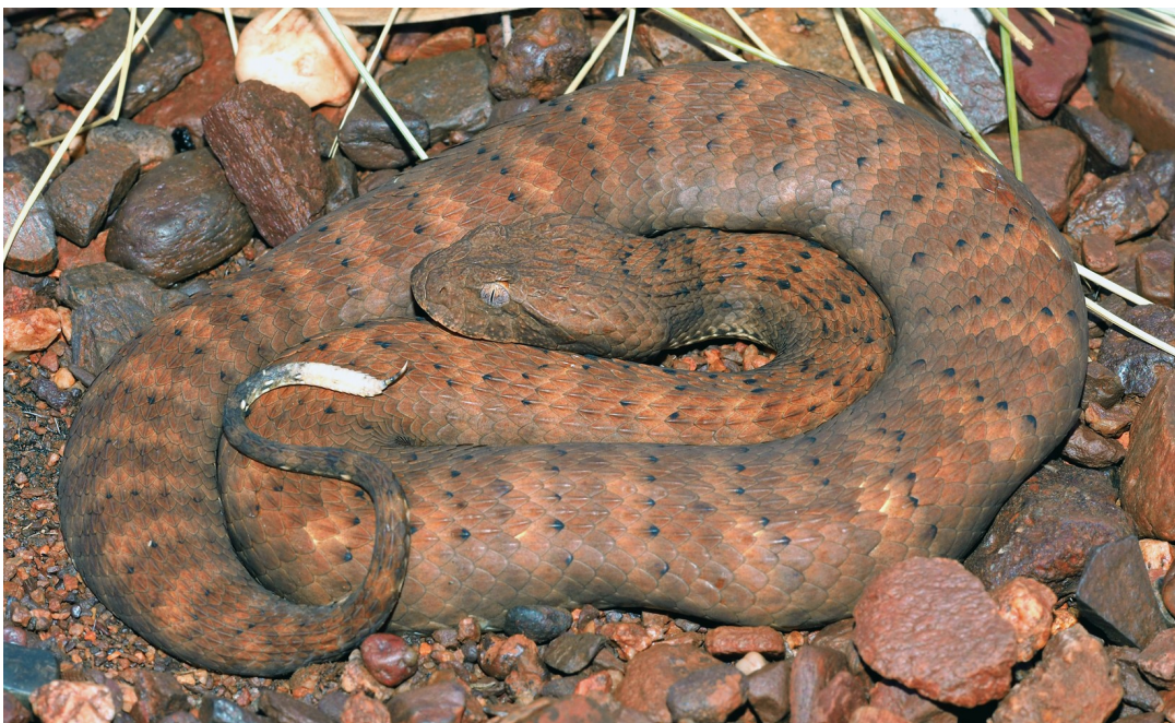
Pilbara Death Adder ( Acanthophis wellsi )