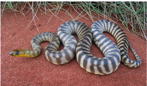
Woma aka Sand Python ( Aspidites ramsayi )