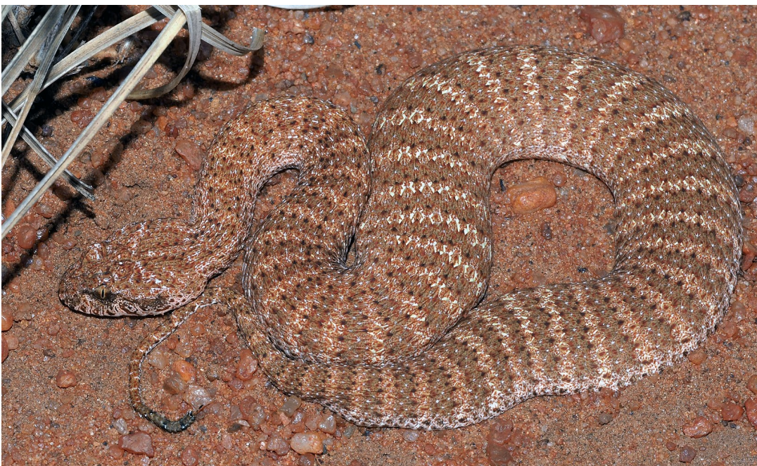
Desert Death Adder ( Acanthophis pyrrhus )

The harmless snakes include 8 blind snakes (only 5 shown), 5 pythons and 3 medically insignificant technically venomous snakes.